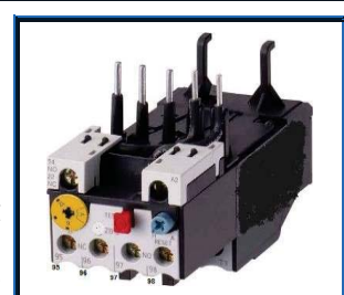
Figure 3: Motor protection relay

The thermal overcurrent relay is designed to protect the consumers from excess heating due to overload or phase failure. Additionally, it usually features a trip-free mechanism to prevent re-arming as long as the heat has not dissipated. Motor protections relays generally trigger when 1.2 of the preset current has been reached, however, they do not protect from short circuits. Additional safety fuses or automatic circuit breakers are required for short circuit protection when protection relays are being used.